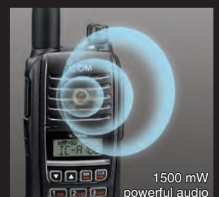
1500 mW powerful audio